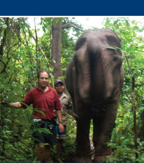
The legal expert with his field assistant