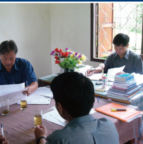
Meeting in pilot area