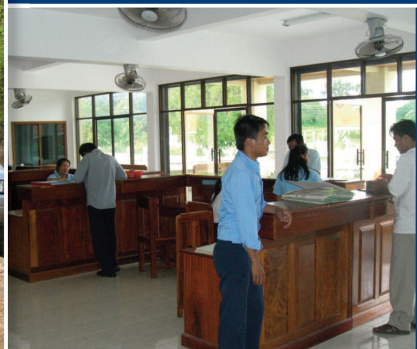
Local cadastre department