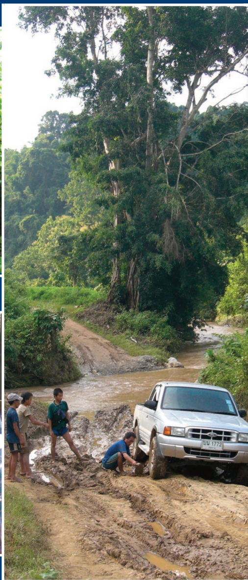
On the path to the pilot project