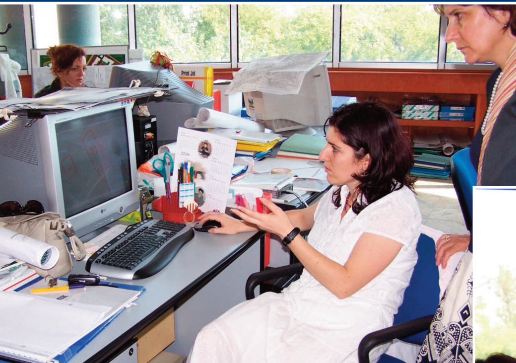
Discussions with GIS-users