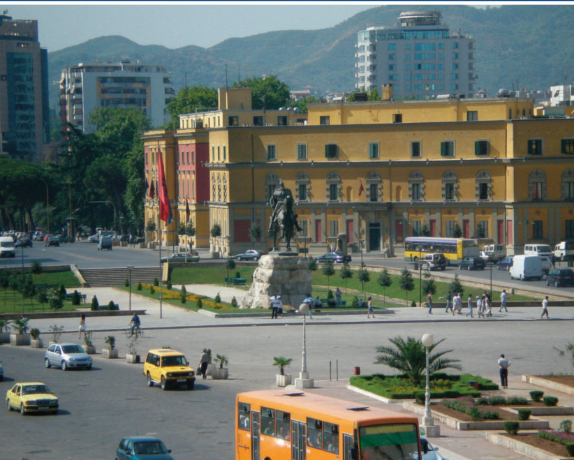
Public busy life in Tirana