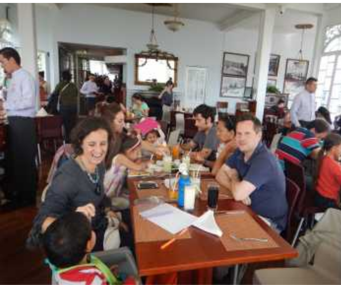
Impressions of Bogotá