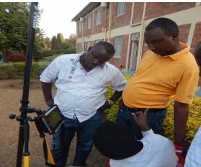
GIS - Training premises in Kigali