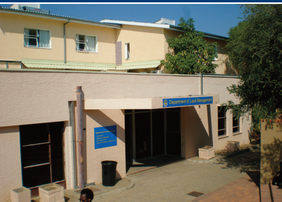
Entrance to the Deeds office (surprime authority of land cadastre authority)